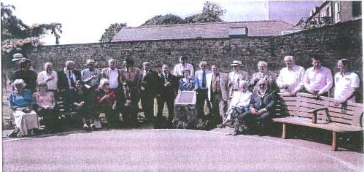
COMPLETION OF THE JUBILEE PROJECT IN THE CORONATION GARDEN

I am pleased to report that the Civic Society's latest project in the Coronation Garden, North Bar Within, was completed in July, ending with a "thank you" celebration there on the 5th for all those directly involved.